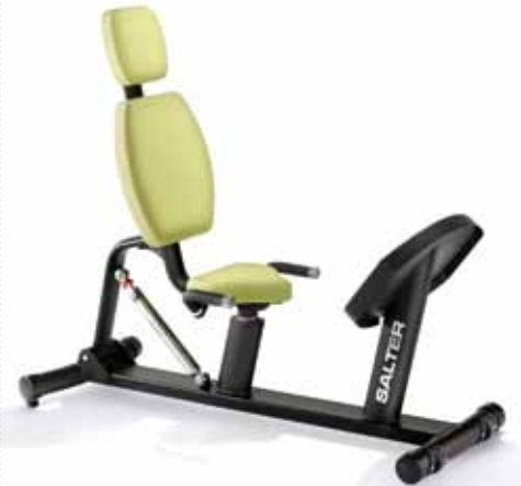
† M-187 | LEG PRESS