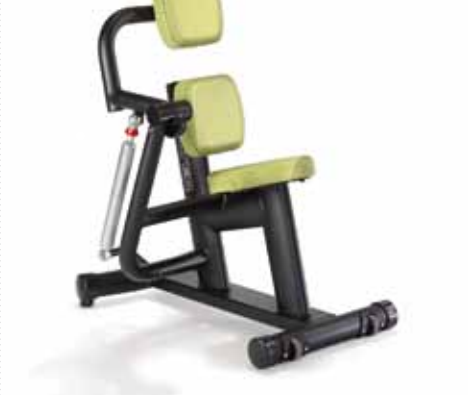
† M-147 | AABDOMINAL / LUMBAR