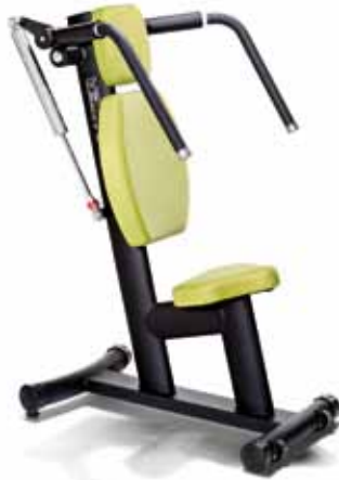
† M-176 | VERTICAL PRESS / PULL