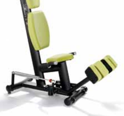
† M-183 | ABDUCTORS / ADDUCTORS