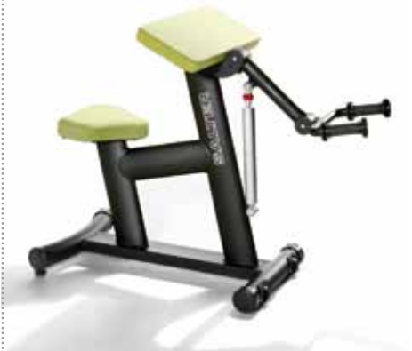
† M-120 | BICEPS / TRICEPS