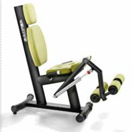
† M-126 | QUADRICEPS / FEMORAL