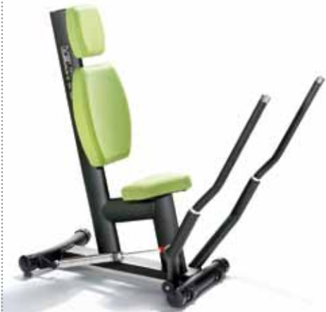
† M-140 | HORIZONTAL PRESS / PULL