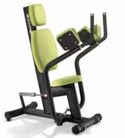
† M-184 | PECTORAL / SCAPULAR ZONE