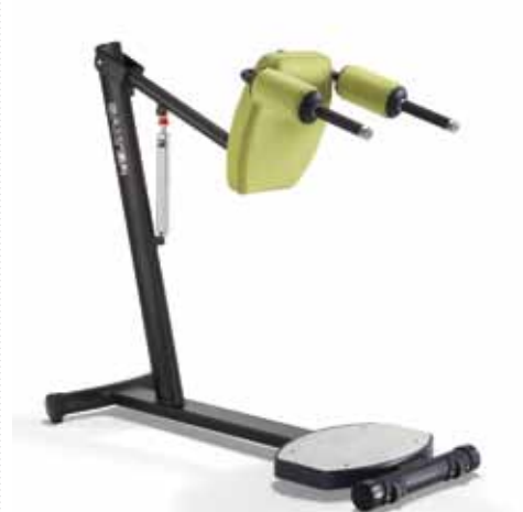
† M-185 | SQUAT / CALVES