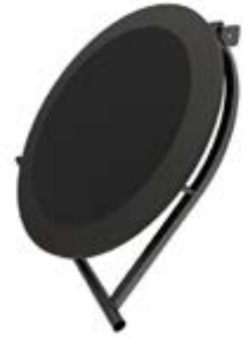
MOVEABLE BAR ACCESSORY