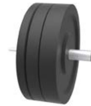
PLATE STORAGE ACCESSORY

Ref: ES16602.02 ES16605.02 Other: columna 80mm columna 160mm