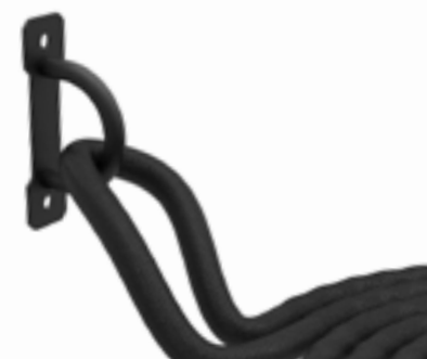
ROPE SUPPORT ACCESSORY