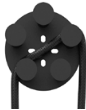
DRUM WITH ROPE ACCESSORY