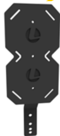
DOUBLE BRACKET ACCESSORY

Ref: ES16601.02 ES16604.02 Other: columna 80mm columna 160mm