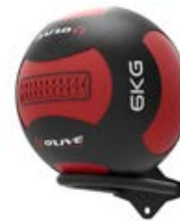
BALL STORAGE ACCESSORY