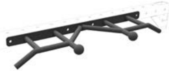
MULTI-GRIP PULL-UP BAR ACCESSORY