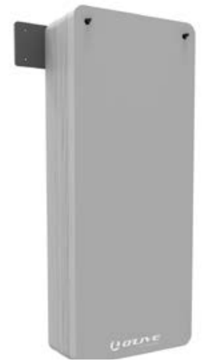
COMPACT ADJUSTABLE HANGER