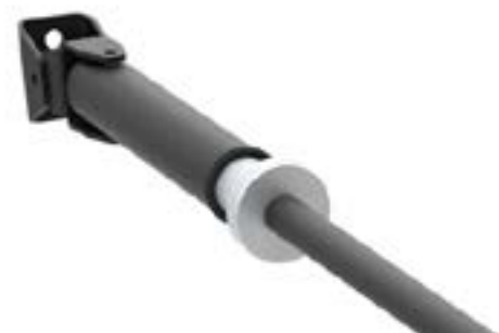
CORE TRAINER ACCESSORY