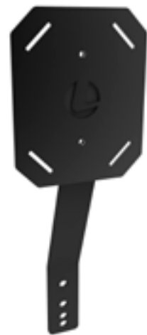
SINGLE BRACKET ACCESSORY

Ref: ES16601.02 ES16604.02 Other: columna 80mm columna 160mm