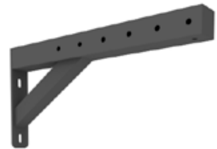
ACCESORIO VOLADIZO, 800

Ref: ES33201.00 ES33202.00 Other: for columns 160 mm for columns 80 mm