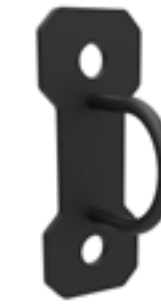
ELASTIC RING ACCESSORY