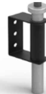
BATTLE ROPE / STORAGE ACCESSORY