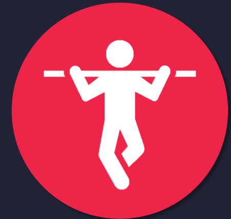
INDOOR AND OUTDOOR STRUCTURES